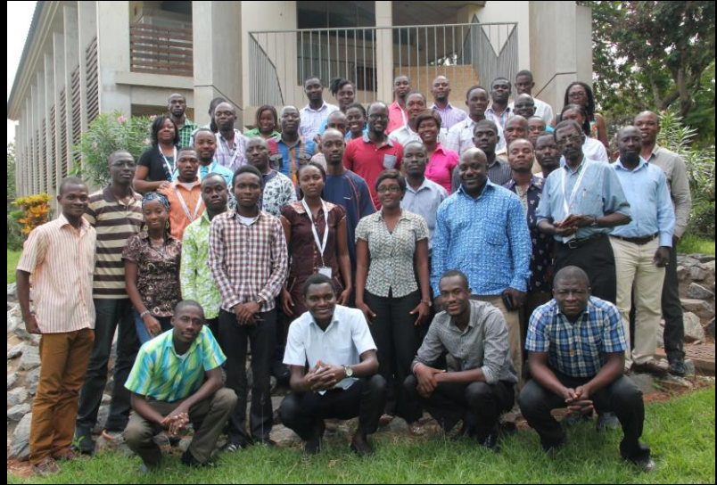
Group picture of the participants of the NMIMR 2014 Intermediate bioinformatics workshop.