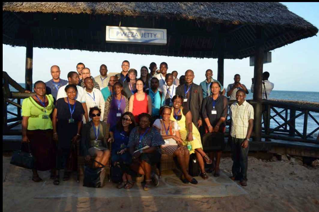
Group picture of the 31 travel fellowship recipients provided by the Wellcome Trust and H3ABioNet to attend and present their work at the ISCB and ASBCB conference on Bioinformatics, 2015.