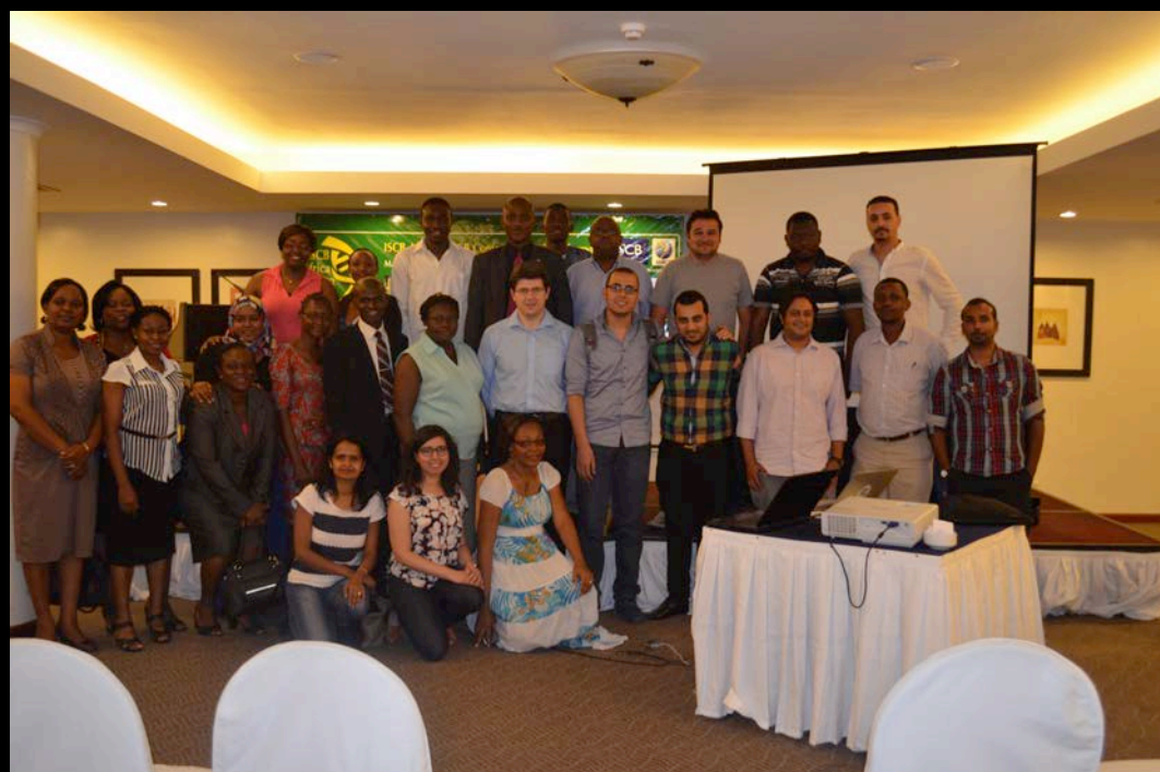
Group picture of attendees to the Student Symposium organised by the ISCB and ASBCB Student Councils and attended by students and junior academics.