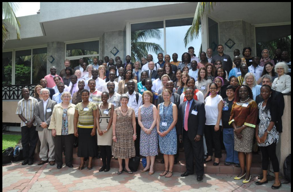
Group picture of H3Africa Consortium Meeting Attendees.